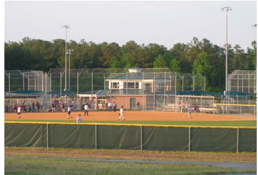
Thomas Brooks Park - Town of Cary

USA Baseball recently relocated its national headquarters to the Triangle region. This organization will receive funding to assist with the development of a national training center in western Wake County at the Town of Cary's Thomas Brooks Park. This Center will address a need identified in the Wake County Parks and Recreation Seven-Year Master Plan for additional practice and play facilities throughout the County. The Center will include the construction of four Major-League-Baseball-level playing fields at Thomas Brooks Park. The Town of Cary appropriated $8.5 million in its capital improvement program for the training center. The center is tentatively slated for completion by 2006.