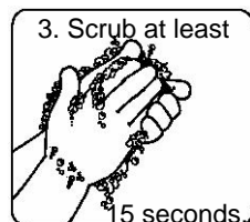
3. Scrub at least 15 seconds