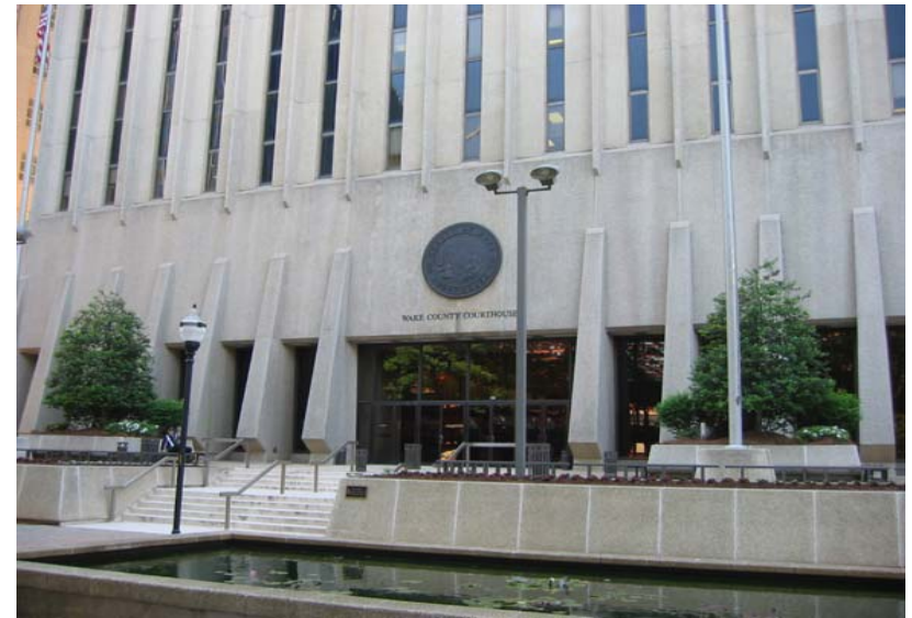
Wake County Courthouse - Fayetteville Street Entrance