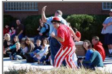
Flow Circus Variety Arts, sponsored by the Friends of the Library, entertained guests at the library's birthday party.