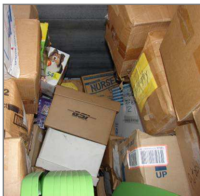
Where we begin on April 1

Each year the Friends Board of Directors, Friends members, library staff and volunteers from the community work throughout April to collect and sort books in preparation for the used book sale.