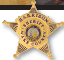
Wake County Sheriff's Office