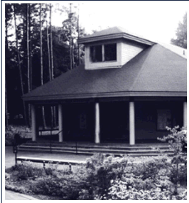
BLUE JAY CENTER FOR ENVIRONMENTAL EDUCATION

• • • • • PARK HOURS GROUNDS: 8 A.M. - SUNSET, SEVEN DAYS A WEEK.