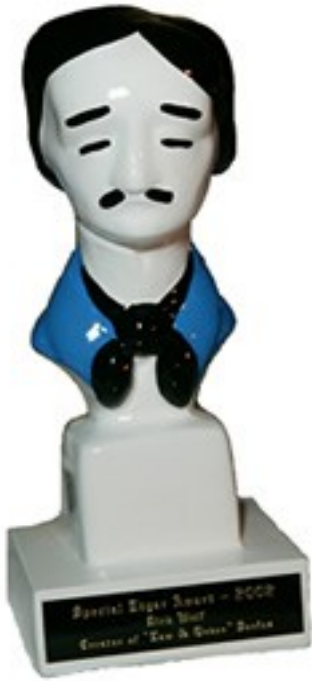
The Edgar Award, mystery writing's equivalent of an Oscar or Grammy

Since 1945, the Mystery Writers of America have annually awarded ceramic statuettes of Edgar Allan Poe, known as "Edgars," for outstanding contributions to mystery, crime, and suspense writing. Here are the young adult "Edgars" from 1997-2006.