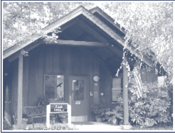
VIEW OF PARK OFFICE