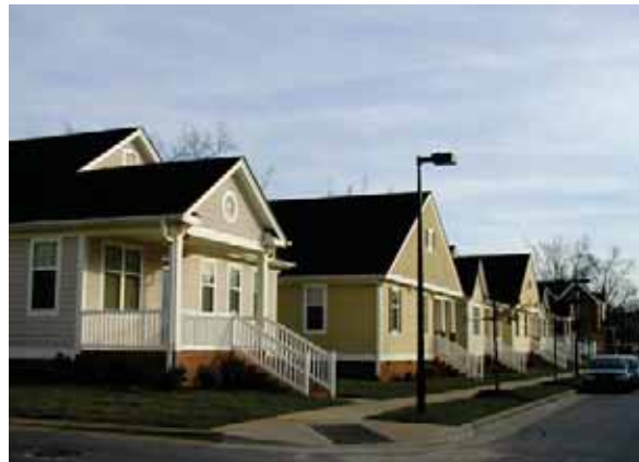
Capital Park, Raleigh