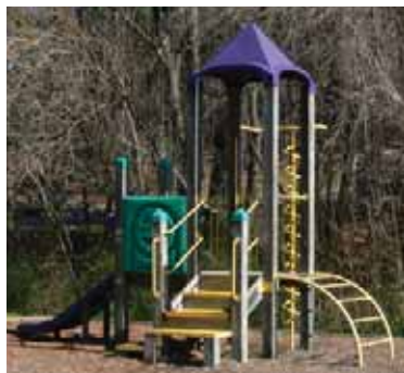
Cedar Moor playground, Raleigh