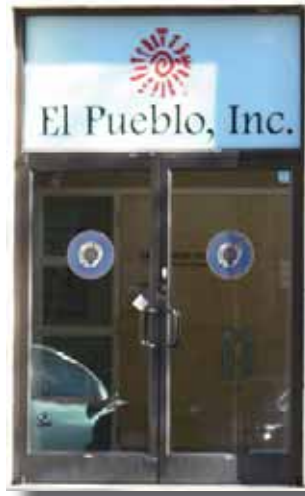
El Pueblo, Inc., Raleigh