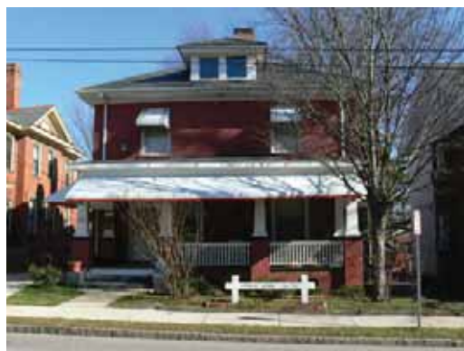
Emmaus House, Raleigh