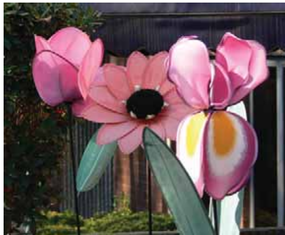
Holly Hill Hospital, Raleigh