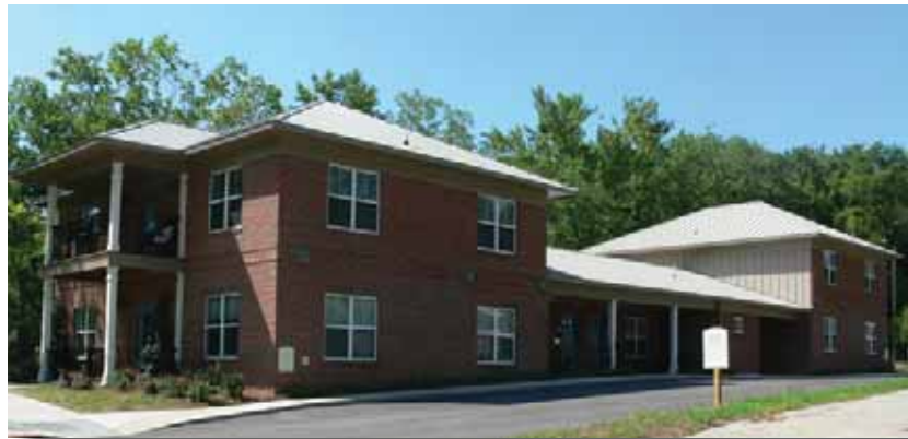
Hope Crest, Raleigh Devoted to homeless individuals.