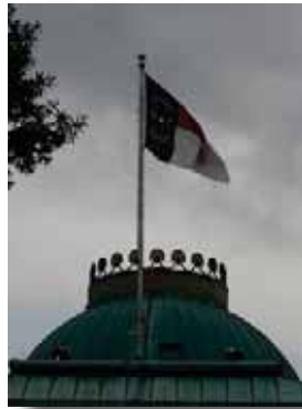
North Carolina State Capitol, Raleigh