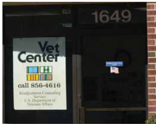
The Raleigh Vet Center

The Raleigh Vet Center ..... 856-4616 1649 Old Louisburg Road, Raleigh 27604 Open 8 a.m. until 9 p.m. Free counseling and referral services provided for veterans by a qualified team of counselors.