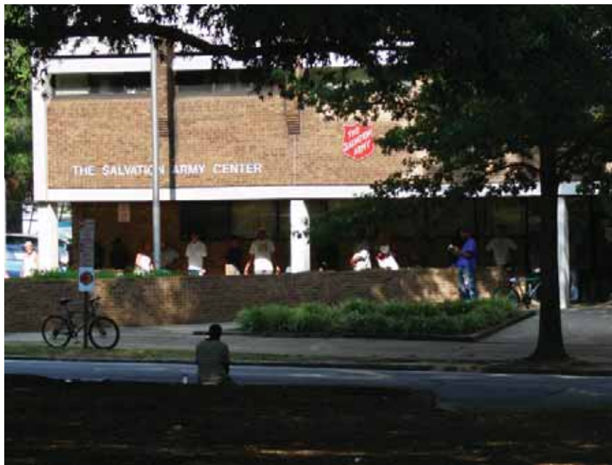
The Salvation Army Center, Raleigh

Admission is $3 to shop (no charge on individual items).