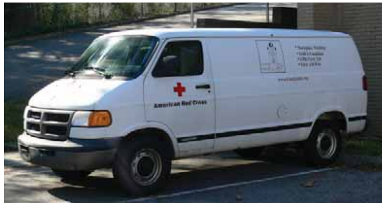
American Red Cross van, Raleigh

421 Chapanoke Road, Raleigh 27601 www.withlovefromjesus.org