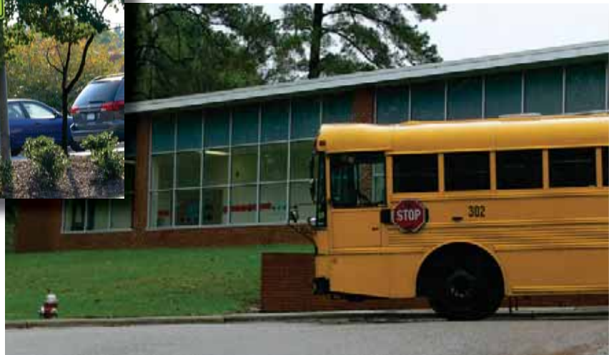
Wake County Public School System