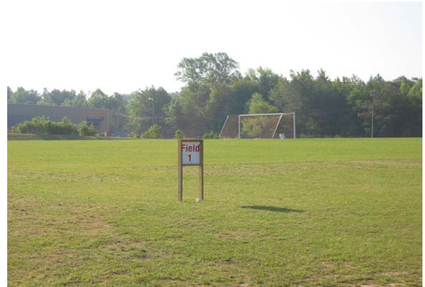
Honeycutt Road Park - Soccer Field #1

The Town of Fuquay-Varina will receive funding to complete the Honeycutt Road Park site. In March 2001, the Town's Board of Commissioners adopted a Parks, Recreation, and Cultural Resources Master Plan which serves as an outline for the orderly development of future programs and the facilities to support them. The site plan calls for two multi-purpose football/soccer fields with lights, a baseball/softball field with lights, tennis courts, a playground and support facilities. Currently, the park site consists of 22 acres with two soccer fields, concessions and restroom buildings, and limited parking facilities. The grant will assist in the funding of athletic fields, and providing facilities for youth athletic programs and associated support facilities. The project will increase the Town's ability to host athletic tournaments and other regional competitions.