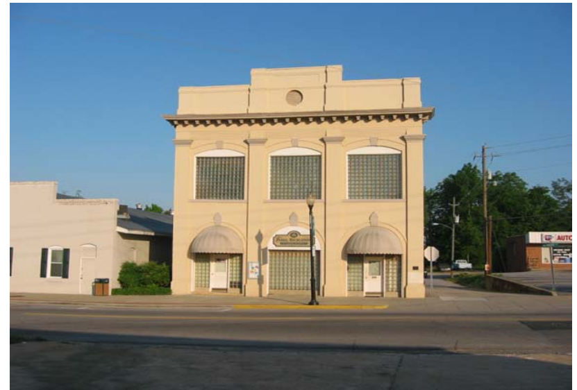
Former 1912 Apex Town Hall

The Town of Apex will utilize funding to assist in the restoration and conversion of the former 1912 Apex Town Hall into a performing and cultural arts facility. This 5,600 square foot structure was designated as an historic landmark by Wake County in 1997 and is also listed on the National Register of Historic Places. Currently, the building houses the Town's Parks, Recreation and Cultural Resources Department.