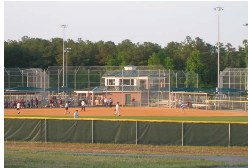
Thomas Brooks Park - Town of Cary

USA Baseball recently relocated its national headquarters to the Triangle region. This organization will receive funding to assist with the development of a national training center in western Wake County at the Town of Cary's Thomas Brooks Park. This Center will address a need identified in the Wake County Parks and Recreation Seven-Year Master Plan for additional practice and play facilities throughout the County. The Center will include the construction of four Major-League-Baseball-level playing fields at Thomas Brooks Park. The Town of Cary appropriated $8.5 million in its capital improvement program for the training center. The baseball complex is due to open in the spring of 2005.